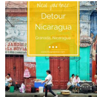
New partner Detour Nicaragua Granada, Nicaragua www.mylonggreentrip.com