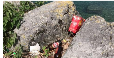
APR 28 Morning clean-up! Public - Hosted by My Green Trip