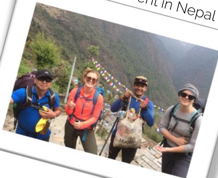
Clean-up Event in Nepal