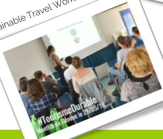
Sustainable Travel Workshop